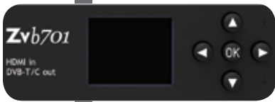
Zvb701 Front Detail