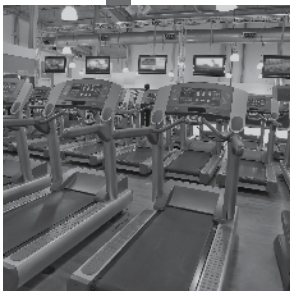
Health & Fitness Clubs