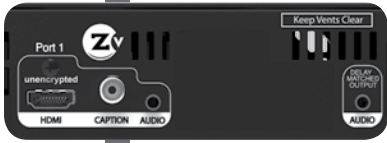
Zvb701 Rear Detail